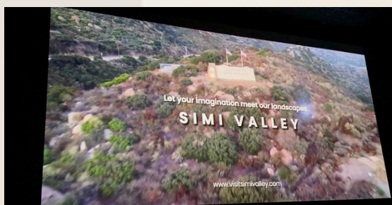
FEATURED ON THE BIG SCREEN