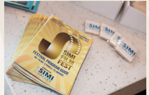
FESTIVAL PROGRAM GUIDE