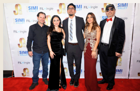
SEEN ON EVERY RED CARPET PHOTO